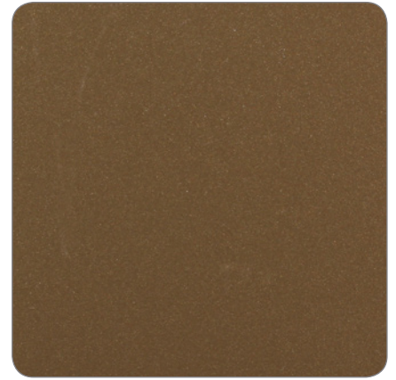
Y2206F Steel Bronze 1