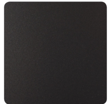
Y2207I Steel Blue Platinum