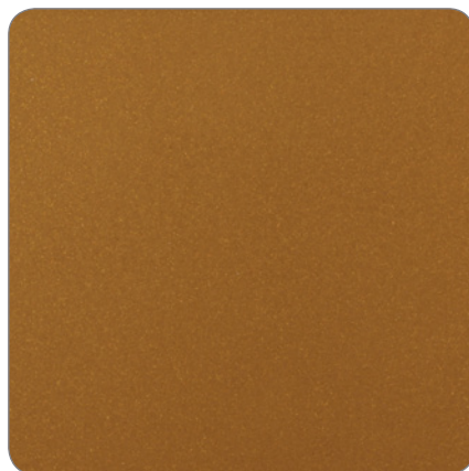
Y2205I Gold Splendour