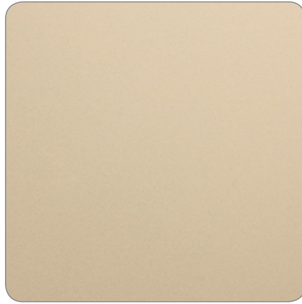
YW255F Golden Beach