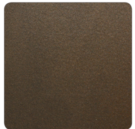
Y2214F Anodic Bronze