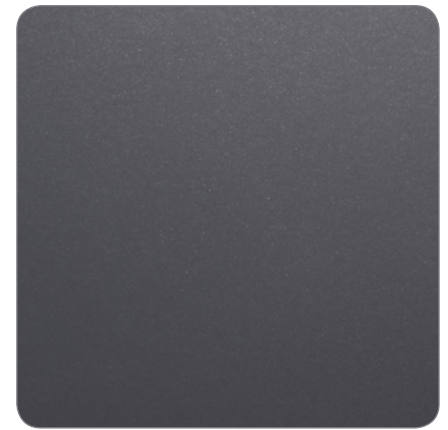
Y2215F Steel Blue Gray 715