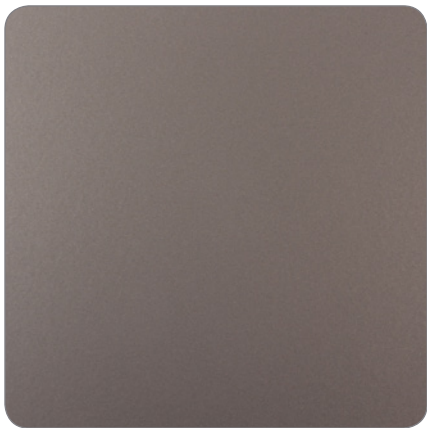
Y2203I Soft Silver