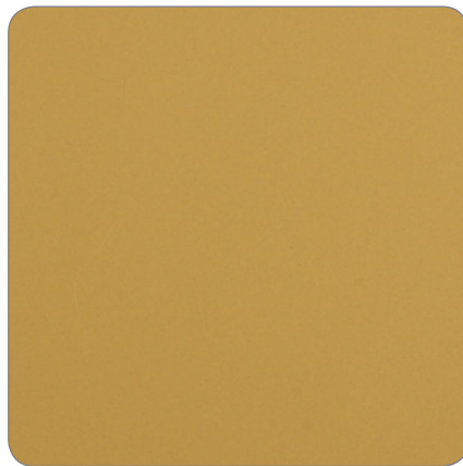
YY217E Gold Pearl