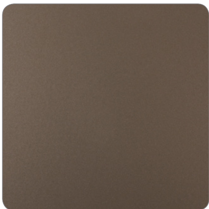
Y2204I Soft Champagne