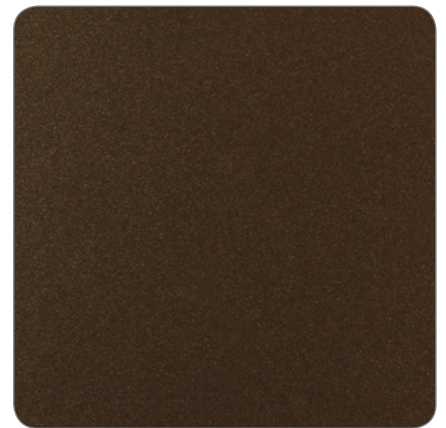
Y2217F Steel Bronze 2