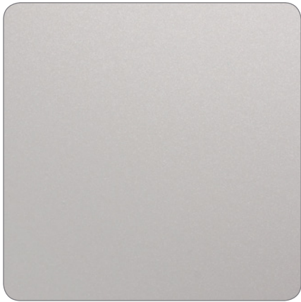
YW201E Anodic Ice